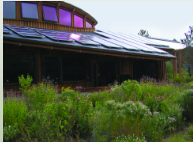
A memorial garden is a great way to honor a loved one.

If you would like to discuss gifts to the Hartley Endowment Fund and specific means of recognition, please call 218.724.6735.